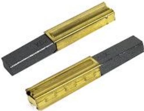
PART # VK-PDS21-48 NEW

Please note that the fan covers on each motor are different. This will help in distinguishing which replacement brushes you will need to order. New motor (top left) previous motor (top right) correlate with the brushes seen below.