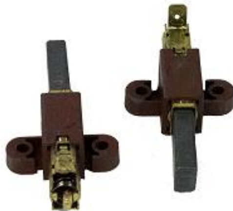
PART # VK-PDS21-48 PREVIOUS